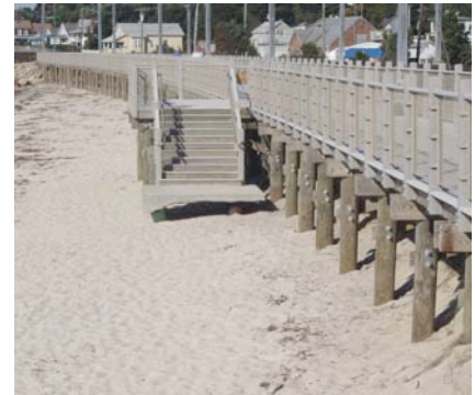
The wooden steps to the Boardwalk in Niantic are shown here in 2004 (L) and in 2007 (R). Engineers anticipated the seasonal rise and fall of the beach by including deep-rooted supports into the design of the lowest steps. Unfortunately, the steps now are undermined and exposed year-round.

increase in traffic. Beach time is a great time, but it also has many consequences.